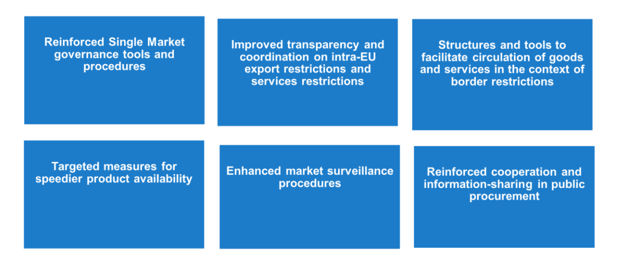
Figure 2 Key elements of the Single Market Emergency Instrument

2021,<sup>16</sup> the Commission will propose a Single Market Emergency Instrument to provide a structural solution to ensure the availability and free movement of persons, goods and services in the context of possible future crises. This instrument should guarantee more information sharing, coordination and solidarity when Member States adopt crisis-related measures. It will help to mitigate the negative impacts on the Single Market, including by ensuring more effective governance. It should also build a mechanism through which Europe can address critical product shortages by speeding up product availability (e.g. standard setting and sharing, fast-track conformity assessment) and reinforcing public procurement cooperation. It will be aligned with relevant policy initiatives such as the forthcoming proposal to establish a European Health Emergency Preparedness and Response Authority (HERA), and the upcoming Contingency Plan for Transport and Mobility as well as relevant international practice aiming at addressing emergency situations or ensuring and speeding up the availability of essential products.